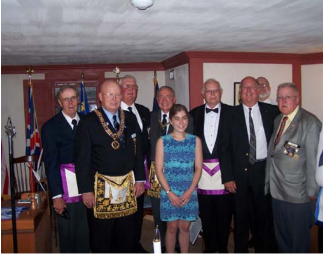
The installing suite.