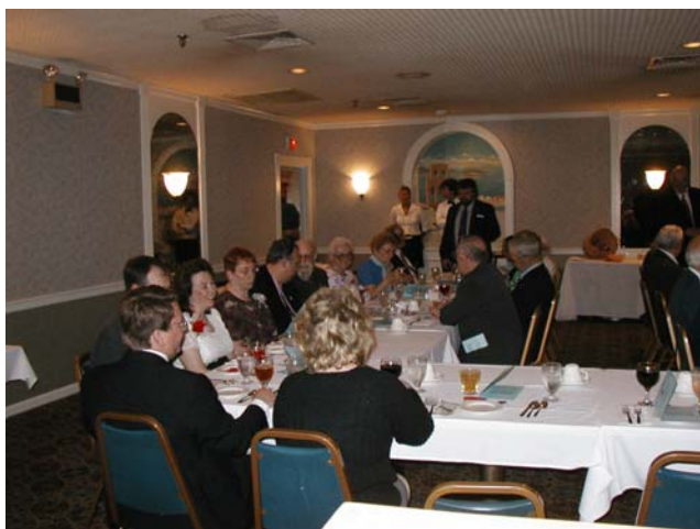
A scene from the dinner.