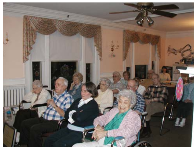
Residents of the Masonic Home at the presentation